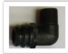
3/4" 90° Elbows & Straight 3/4" (Standard)