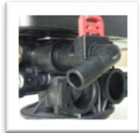
QC Drain Line