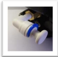
QC Brine Line